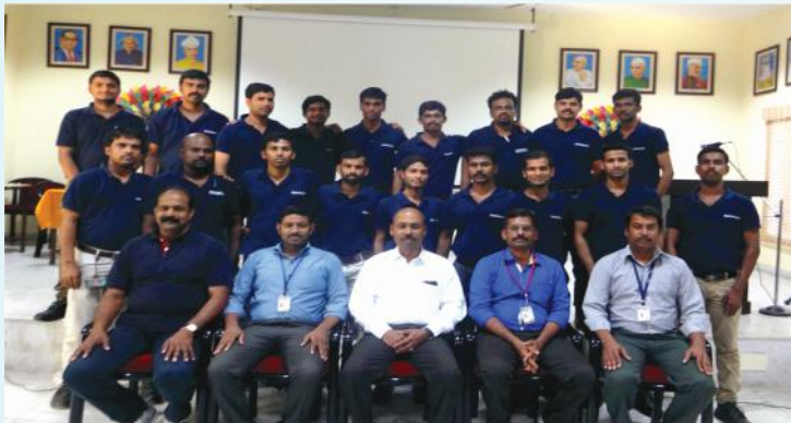
1 st Batch Students of DAIMLER