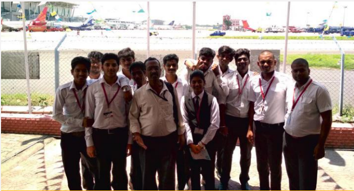
Indian Oil Corporation