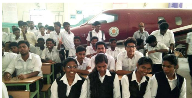
Educational Visit at KCG College&HITS

HIET Aviation college conducted an Orientation Day program at its Padappai Campus and all the newly admitted students participated along with their parents. The Chief Instructor and Training Manager welcomed all the parents and students into the institution.