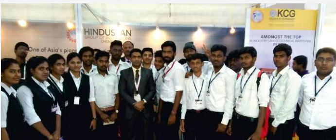
Air show at Hyderabad

A batch of 36 students visited Air show held at Hyderabad in the year 2019. It was a wonderful experience for the students to visit various types of aircrafts from different countries