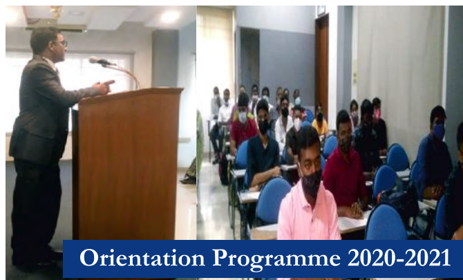
Orientation Programme 2020-2021