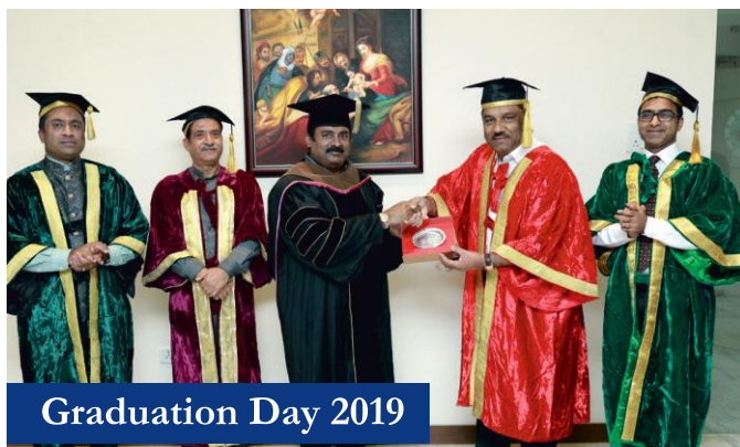
Graduation Day 2019

The DGCA conducts examinations three times every year and HIET Aviation College consistently produces better results every year in the All-India level. Around 93% students of the current grandaunts have cleared the DGCA module examinations, out of which 7 students have cleared all the required modules.