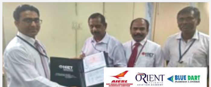
Aviation College signed MOU

A batch of 36 students visited Air show held at Hyderabad in the year 2019. It was a wonderful experience for the students to visit various types of aircrafts from different countries