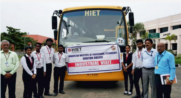
Air Traffic Services