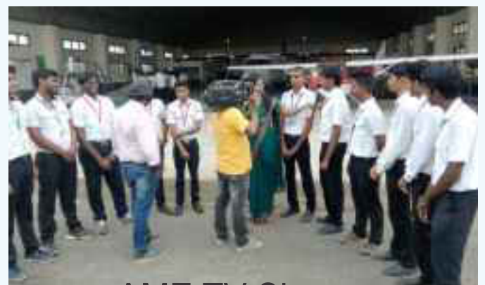
AME TV Show