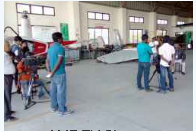
AME TV Show