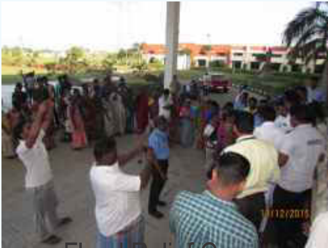
Flood Relief Camp