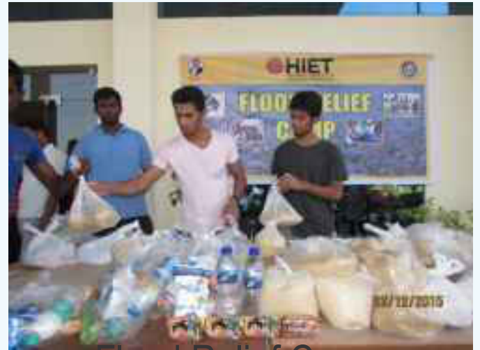
Flood Relief Camp