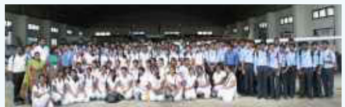
Akshaya Matriculation School, Velachery students visited HIET Campus.